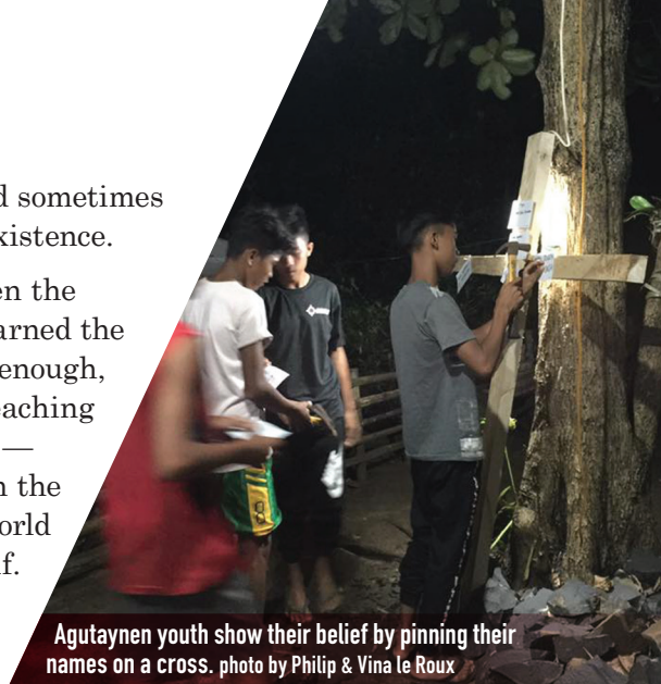
Agutaynen youth show their belief by pinning their names on a cross.

The Agutaynen people now owe gratitude to God alone. And we at Ethnos360 Aviation thank you who enable us to serve the church planting team as they bring Christ to this island.